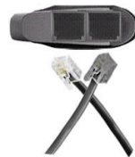
Wrong Wiring but Functional